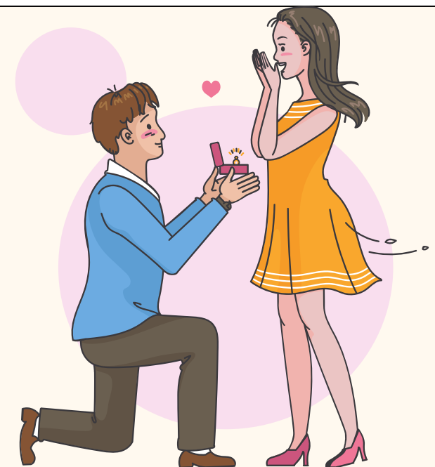
Early marriage and multiple sexual partners