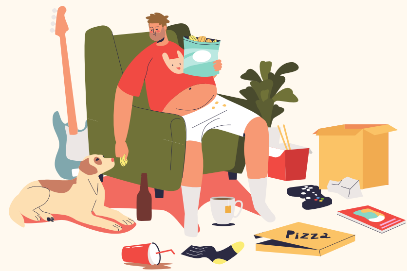
Lifestyle factors (lack of physical activity, unhealthy diet and smoking)