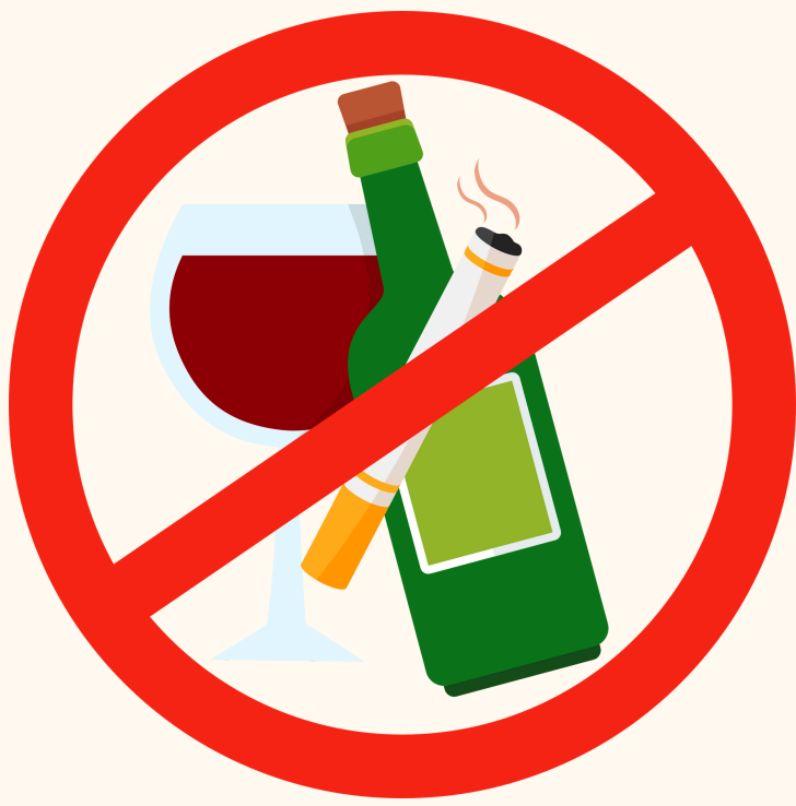
Tobacco and alcohol consumption