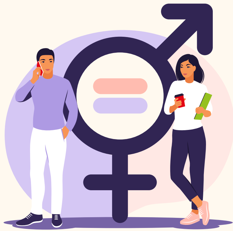
Age and gender